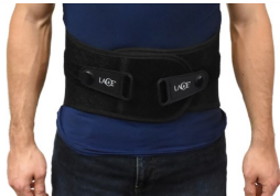
Rigid Anterior Panel