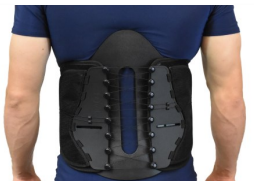
Solid Posterior Frame